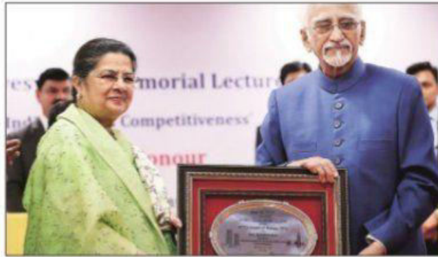
Vice-President Hamid Ansari presents the WTCA Award to Rajashree Birla in Mumbai on Tuesday.

The Vice-President, who presented the World Trade Centre Association (WTCA) Award to Rajashree Birla for her contributions to society, emphasised the need to adopt global standards at the earliest in order to en-