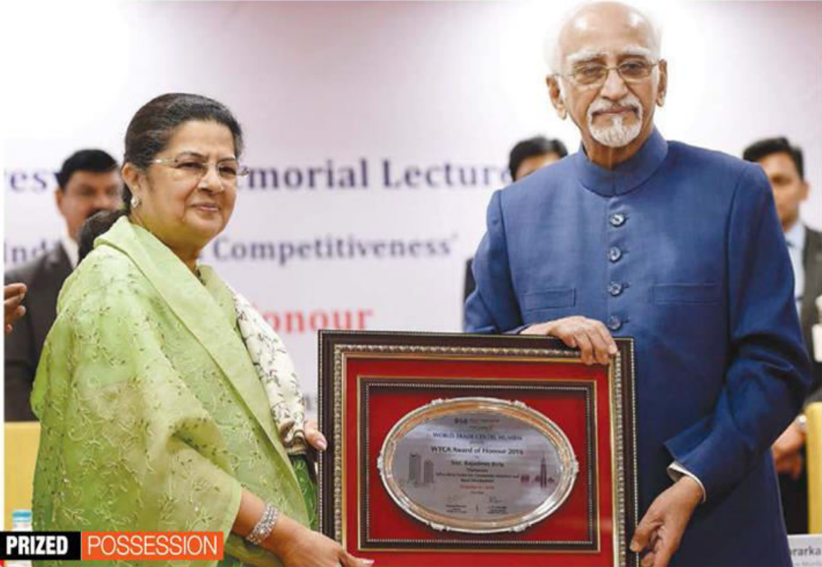
Vice-President Hamid Ansari presents the 'WTCA Award of Honour' to industrialist Rajashree Birla during the 6th Dr M Visvesvaraya Memorial Lecture at World Trade Centre, Cuffe Parade, on Tuesday.