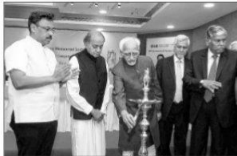
Hamid Ansari, Vice President, lighting the lamp at a function in Mumbai on Tuesday.

Mentioning flagship initiative 'Make in India', Ansari said, "The Government has rolled out policies and regulations, including the flagship 'Make in India', to encourage manufacturing in India. Of course, there are no silver bullets and one policy measure cannot change the dynamics of the sector and