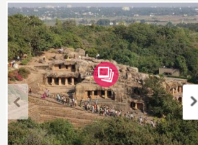
या आहेत भारतातील अद्भूत लेण्या