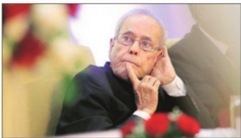
Pranab Mukherjee in Mumbai on Monday. Pradip Das

Lauding the increase in food production, Mukherjee advocated massive investment in the agriculture sector. "...We will have to make agriculture more remunerative... One sure shot way of achieving this is to cut intermediaries and link the farming sector directly to consumer markets. This will have to be supplemented with ample and modern storage facilities, apart from accessibility to affordable quality transport."