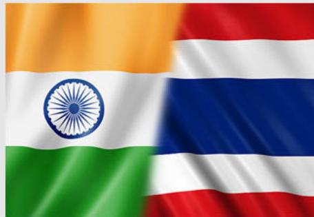
Bilateral economic cooperation between India and Thailand