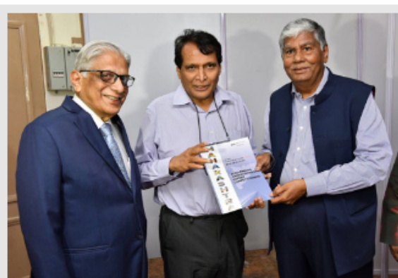
MVIRDC WTC Mumbai presents research study on "Accelerating Maharashtra's Export Competitiveness" to Prabhu