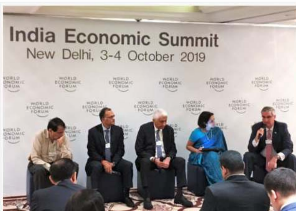
Governor of Indianapolis Erij J Holcomb speaking at India Economic Summit in New Delhi