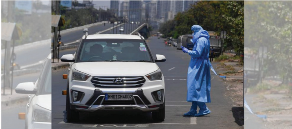
A doctor (R) speaks with motorists at a Drive-thru Collection Point Test Centre during a government-imposed nationwide lockdown as a preventive measure against the spread of the COVID-19 in Mumbai on April 27, 2020.