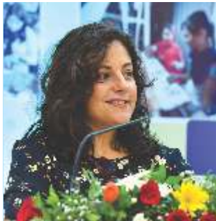
Ms. Stefania Costanza Consul General, Consulate General of Italy

Ms. Stefania Costanza , Consul General, Consulate General of Italy remarked that empowering women and girls is not just about being nice or a matter of pleasantry but a matter of development. Gender