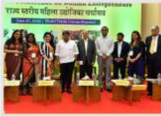
महाराष्ट्र का लक्ष्य महिलाओं के स्वामित्व वाले उद्यमों के हिस्से को 5 वर्षों में 20% तक बढ़ाने का है: उद्योग और खनन मंत्री

मुंबई, 27 जून (वैश्व-एनएन) पिछले अर्धशताब्दी के दौरान 27 जून 2018 को आयोजित महिला उद्यमियों पर राज्य स्तरीय सम्मेलन में महाराष्ट्र सरकार के उद्योग और खनन मंत्री सुभाष देसाई ने कहा कि महिलाएं पहले के 3 Ps - Pickle, Papad और Powder के बजाय उत्पादन, प्रगति और समृद्धि के 3 Ps के लिए जाने जा रही हैं और टेक्स्टाइल्स, ज्वेलरी, आभूषण और इंजीनियरिंग क्षेत्रों में ऊंचाई बढ़ा रही हैं।