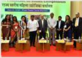
Maharashtra aims to enhance share of women-owned enterprises to 20% in 5 years: Minister of Industry and Mining.