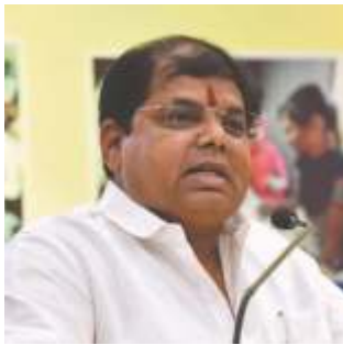
Shri. Praveen Pote Patil Hon. Minister of State (Industry and Mining), Government of Maharashtra

Speaking on the occasion, Shri. Praveen Pote Patil, Hon. Minister of State (Industry and Mining), Government of Maharashtra suggested that