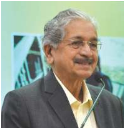
Shri. Subhash Desai

Hon'ble Minister of Industry and Mining, Government of Maharashtra