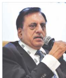
Dr. Vinay Sharma, Officiating Chairman, Export Promotion Council for EOU and SEZs

enhanced through access to cheaper imports of raw materials and intermediate goods. The other major point is the competitiveness of domestic value chain. Enhancing the competitiveness of MSMEs to boost productivity and make them internationally competitive can be achieved by ensuring ease of entry into the market for new firms; ease of exit for failing firms from the market; increasing foreign direct investment; transfer of technology; strengthen intellectual property regime; skill development through educational and research programmes etc.