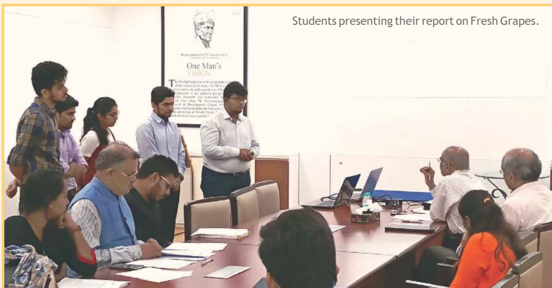
Students presenting their report on Fresh Grapes.