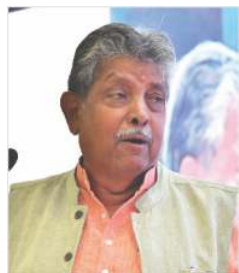
Mr. Prafulla Samal, Hon'ble Minister for Social Security & Empowerment of Persons with Disabilities, Women & Child Development & (Mission Shakti), Micro, Small & Medium Enterprises, Government of Odisha

The Minister invited the business community to explore investment opportunities in Odisha. Emergence of GVCs has added pressure to MSMEs' long-term sustainability in certain regions and countries.