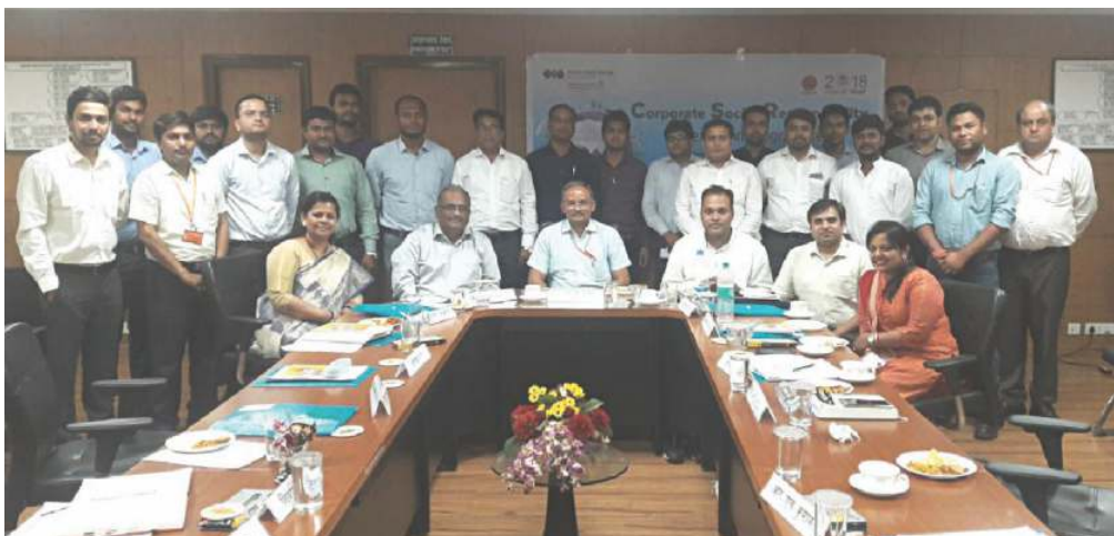
A view of the participants at the CSR Orientation Programme.

The session was held in Paradip, Odisha on March 23, 2018.