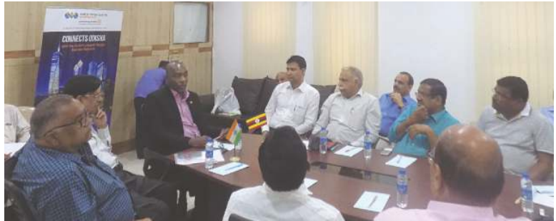
Ambassador Kezaala Mohammed Baswari B, Deputy High Commissioner, Uganda High Commission in New Delhi, Republic of Uganda addressing representatives of the industry.

The industry members discussed various issues regarding establishment of business houses in Uganda and fostering sustainable business linkages and networks with the trade fraternity of Uganda with the help of the High Commission in New Delhi. The members further discussed various achievements and outreach of their businesses with other countries across the globe.