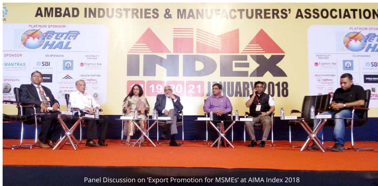
Panel Discussion on 'Export Promotion for MSMEs' at AIMA Index 2018

The panel discussion was held in Nashik on January 20, 2018.