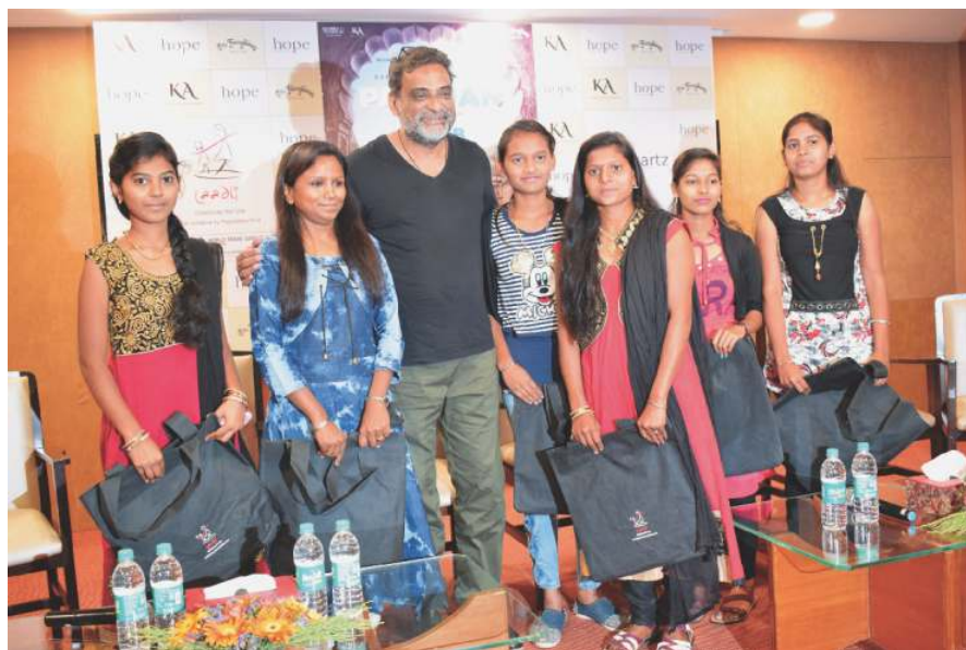
■ Mr. R. Balki, Film Director, Padman (center) along with women participants at the press conference.

The press conference was held at the World Trade Centre Mumbai on February 8, 2018.