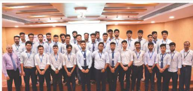
90 students from MITSOM, Pune on January 18, 2018