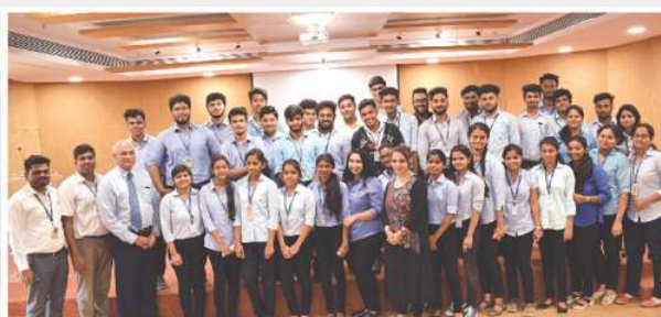
40 students from Vidyalankar School of Information Technology on January 19, 2018