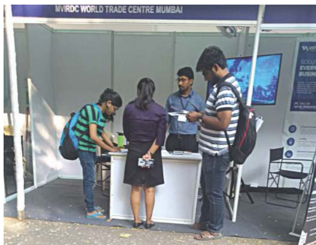
World Trade Centre Mumbai Stall at the IIT Bombay E-summit.

The Exhibition was held in Mumbai on January 27, 2018.