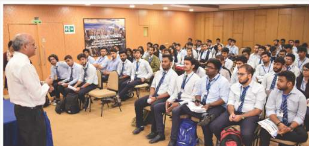
90 students from MITSOM, Pune on January 19, 2018