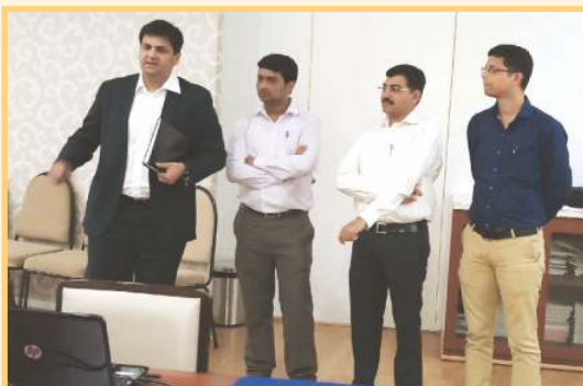
Students presenting their report on Export of Industrial Fragrances & Flavours covering Import of Capital Goods and Raw Materials.