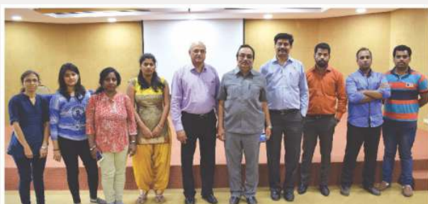
8 Entrepreneurs from Prasanna Academy on January 18, 2018