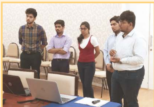
Students presenting their report on Fresh Grapes

The presentation and viva voce were held at the World Trade Centre Mumbai on January 4, 2018.