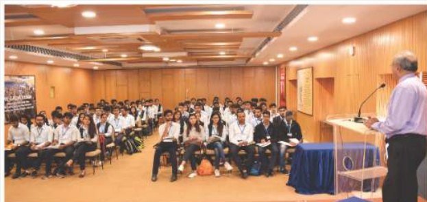
90 students from MITSOM, Pune on January 17, 2018