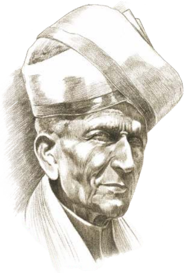
Bharat Ratna Sir M. Visvesvaraya (15 September, 1860 - 14 April, 1962)

MVIRDC World Trade Centre Mumbai is the realisation of the vision of Sir M. Visvesvaraya. MVIRDC is the promoter of World Trade Centre Mumbai. MVIRDC WTC programmes are conducted to guide MSMEs with reliable information for business planning. Various research-based seminars, workshops and training programmes are conducted to sensitise MSME entrepreneurs on various aspects of trade and business and sharpen their skills. Thus, the objective of MVIRDC research is to enhance MSME competitiveness and promote their integration into global markets.