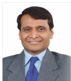
Mr. Suresh Prabhu, Hon'ble Minister of Commerce and Industry, Government of India

The inaugural session on Day 1 (February 22, 2018) witnessed a power-packed line of distinguished guests from the government, multilateral organisations, think tanks and trade and industry who set the tone for discussion on various topics at sessions in the Summit.