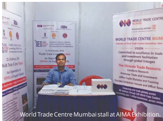
World Trade Centre Mumbai stall at AIMA Exhibition.

The exhibition was held in Nashik between January 18-20, 2018.