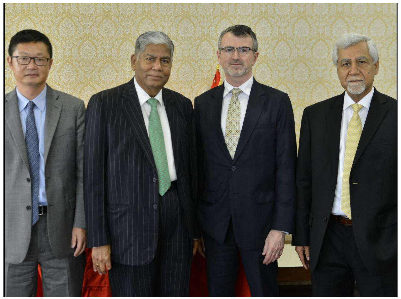
August 2, 2016