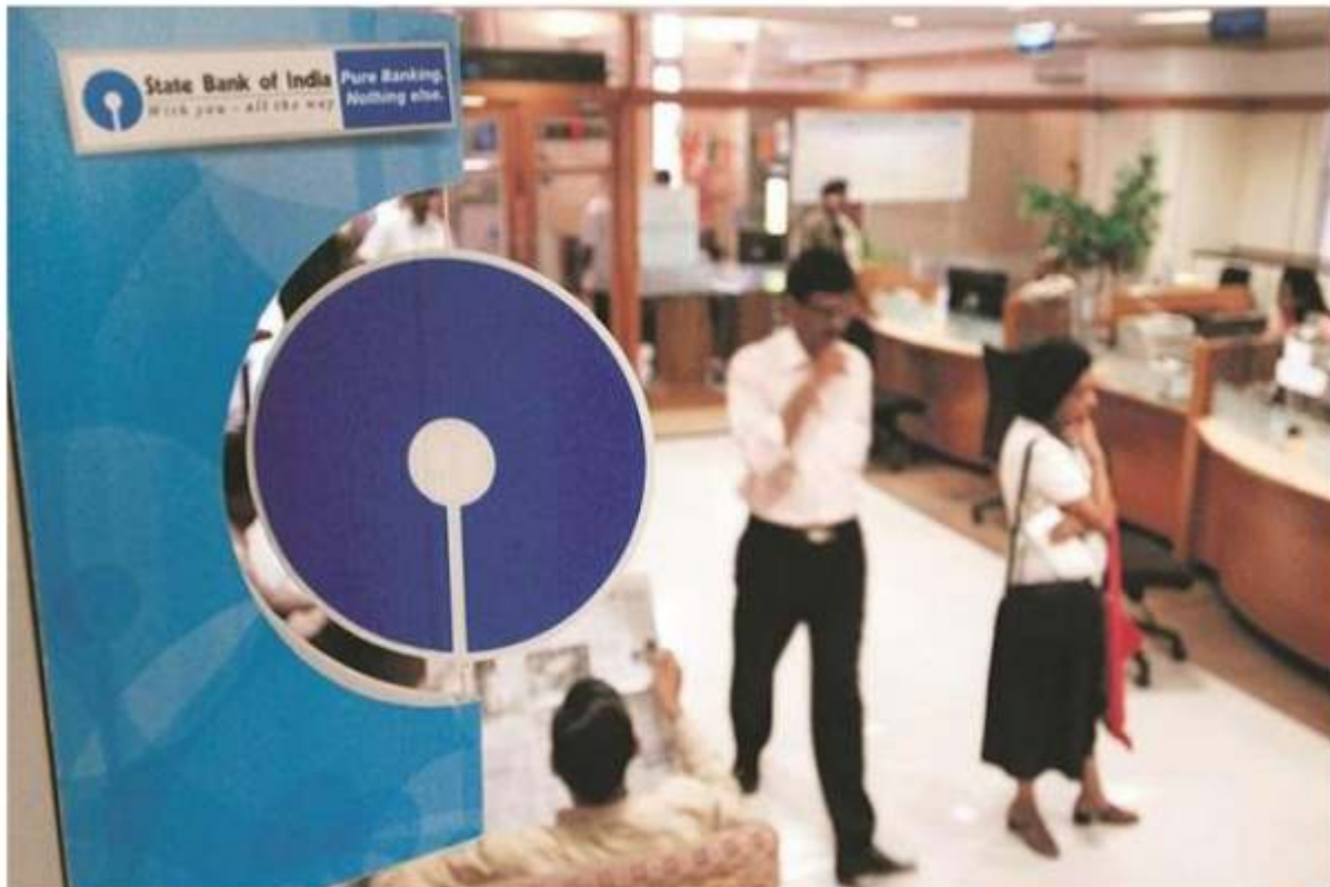
State Bank of India has set a target of disbursing Rs 700 crore to MSMEs in the Mumbai circle by the end of June.

The coronavirus pandemic in India has thrown hundreds and thousands of people out of work, various sectors are devastated, the government is struggling to maintain a delicate balance between keeping the countrymen safe and making sure that they can still make a living or even have enough to eat. In such a scenario, the financial repercussions are intense, especially for the MSMEs.