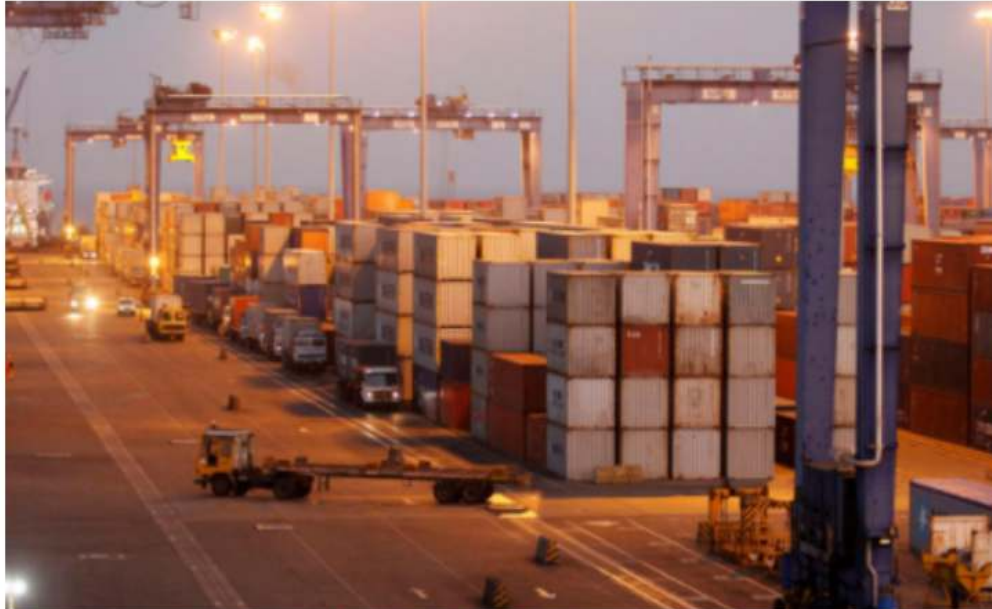
USA, Turkey, Brazil, China, Argentina, European Union and South Korea are the top seven countries that imposed anti-dumping duties on Indian products as of 2021.

Mrityunjay Bose, DHNS, Mumbai, AUG 20 2021, 12:35 IST UPDATED: AUG 20 2021, 12:35 IST