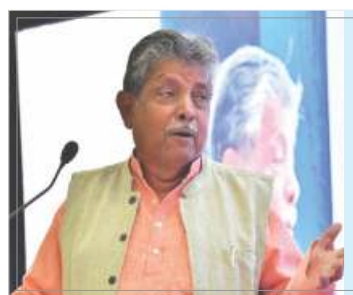
Shri. Prafulla Samal Hon'ble Minister for Social Security & Empowerment of Persons with Disabilities, Women & Child Development & (Mission Shakti), Micro, Small & Medium Enterprises, Government of Odisha

Speaking about India's position in GVCs, Shri. Rawal said India is leading in artificial intelligence. Heads of top global information technology companies are from India. The new government in